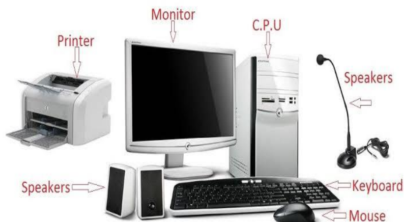
Basic parts of a Computer